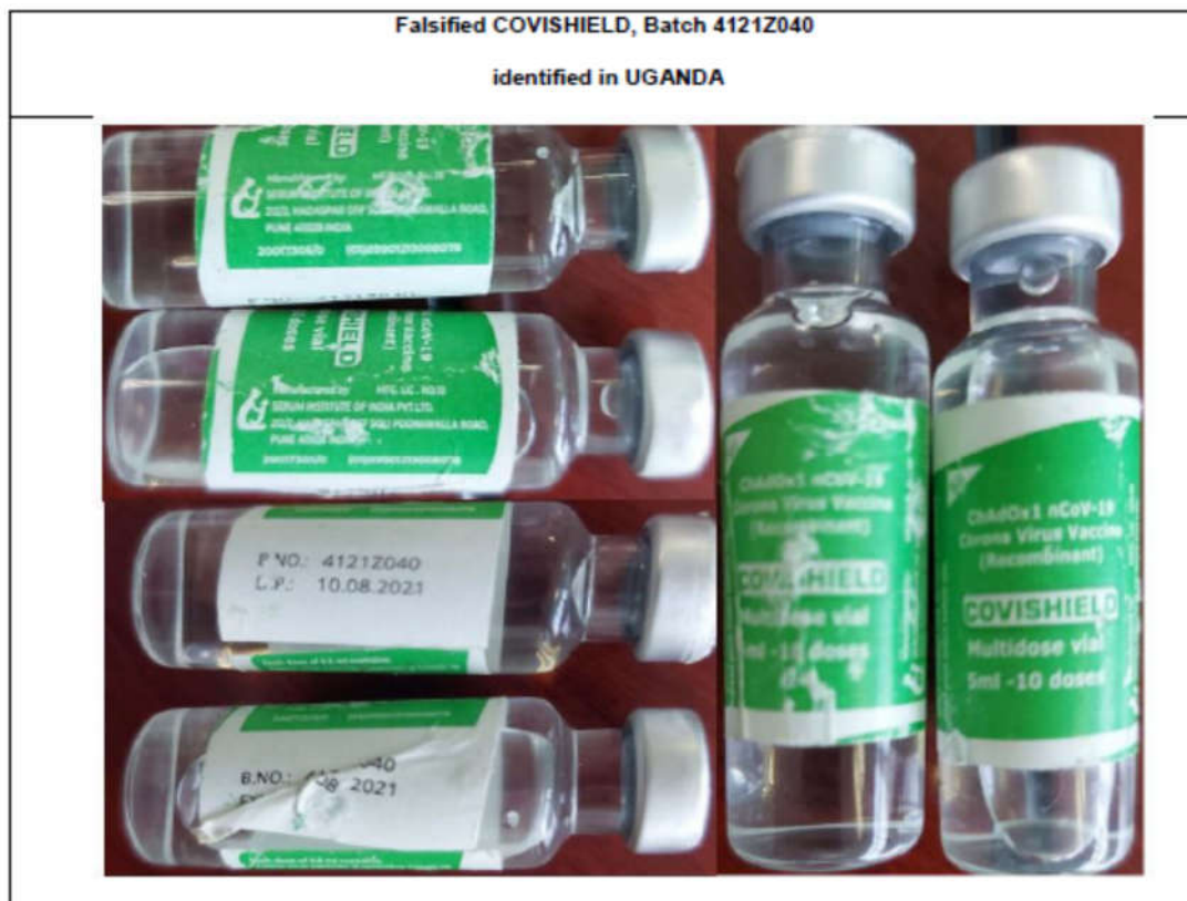
Table 2: Photographs of products subject of WHO Medical Product Alert N°5/2021

National regulatory / health authorities are advised to immediately notify WHO if these falsified products are discovered in their country. If you have any information concerning the manufacture, distribution, or supply of these products, please contact rapidalert@who.int